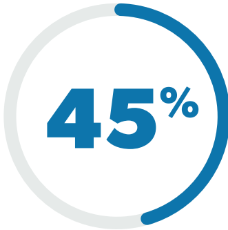
“OKAY” or “IN CRISIS” MARRIAGES